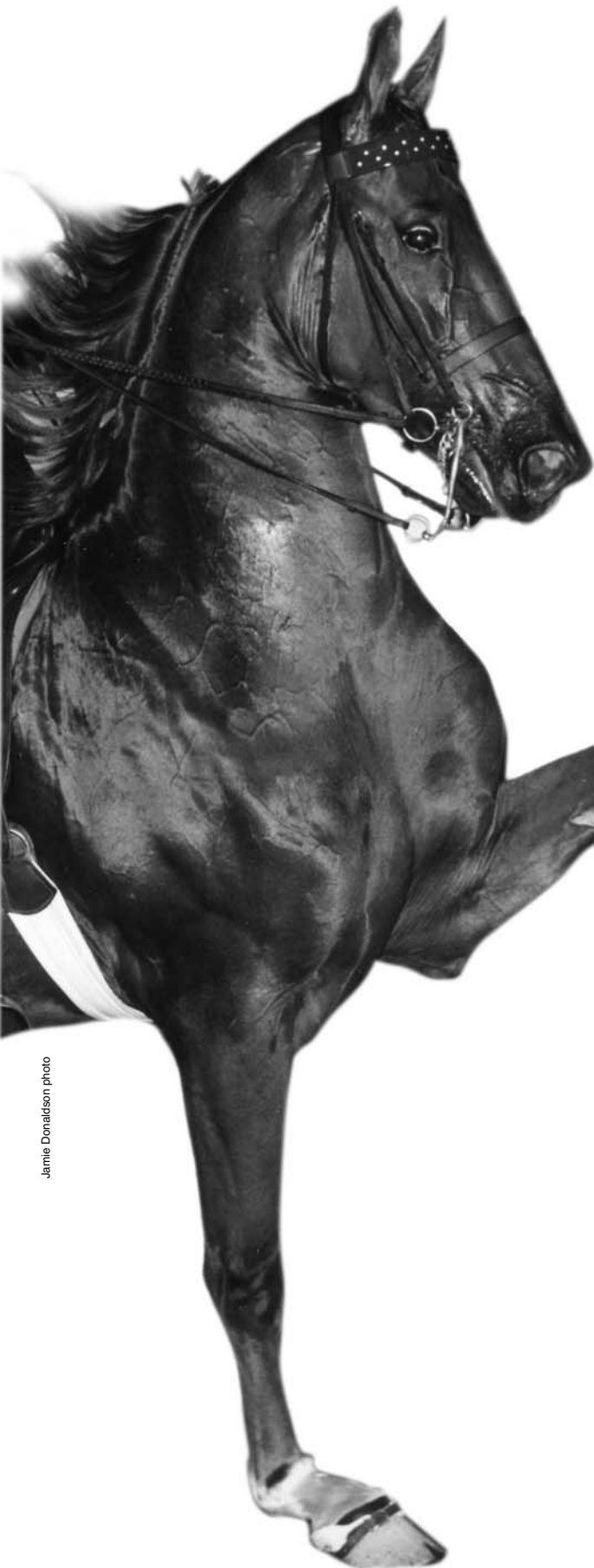
Jamie Donaldson photo