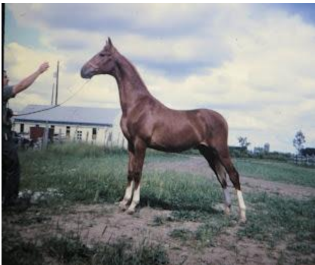
Alloway's Tam O'Shanter as a yearling