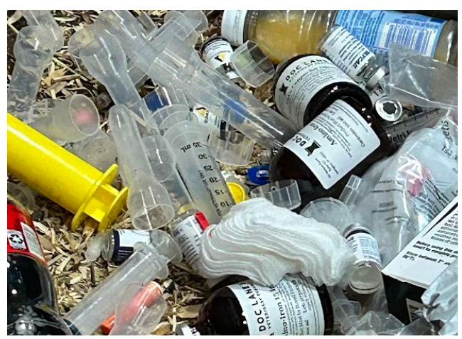
Image 21: Trash contents in a North Wing dumpster Tuesday afternoon