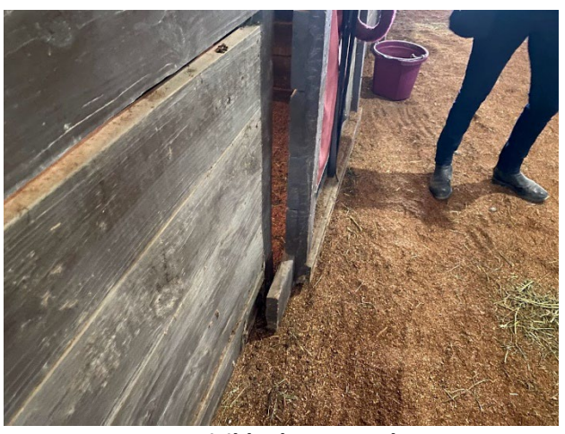
Image 4: Gap visible due to no door stop at bottom of sliding door in permanent barn