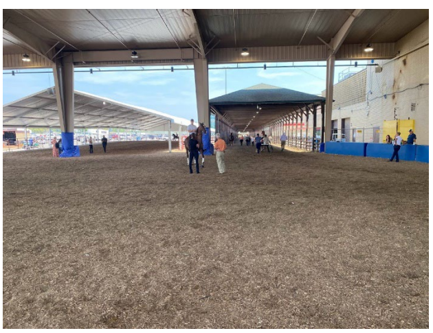
Image 2: View inside the make-up area looking down Stopher Walk toward permanent stabling