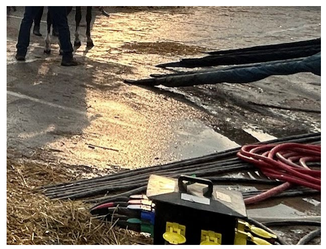
Image 11: Electrical box adjacent to horse washing and mixed hay/detritus