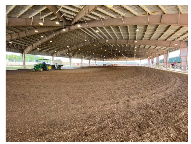
Image 3: Covered arena maintenance Wednesday, August 23, afternoon