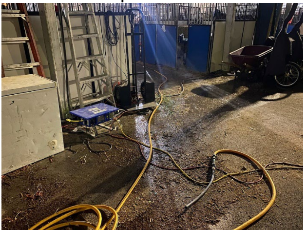
Image 12: Electrical box at the back of Tent A adjacent to wet area