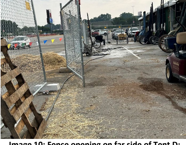
Image 10: Fence opening on far side of Tent D; manure dumped on outside of fence