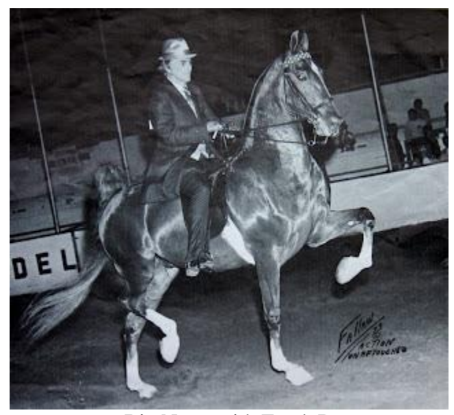
Big News with Frank Dye